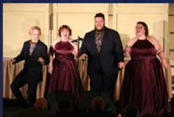
SWEET & SOUR