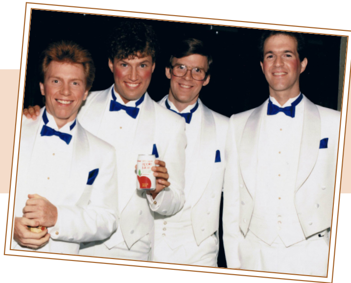
<<<< Interstate Rivals Hartford, 1987 and a can of apple juice